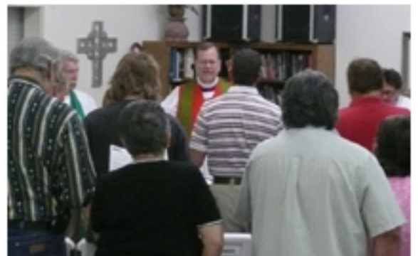
Church of the Savior, Ruidoso, NM

I am convinced that repentance is the most powerful weapon we have.