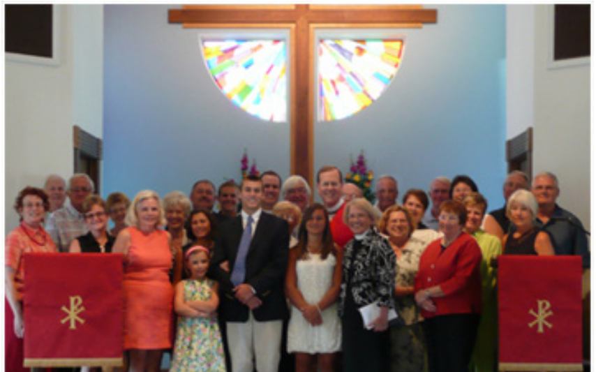
Good Shepherd, Nags Head, NC