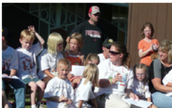
VBS in Durant, IA