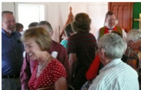
Passing the peace, Epiphany, Cloudcroft, NM